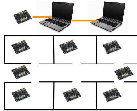
Figure 2. Demo topology

Each application on a sensing device runs inside a sandbox environment where access to hardware resources is only available through the Virtualisation Runtime . Previous examples of virtualisation in sensor nodes have focused on fully virtualising the host OS [1]. Instead we allow the applications to run as native process in a controlled environment. The Virtualisation Runtime performs a number of functions: